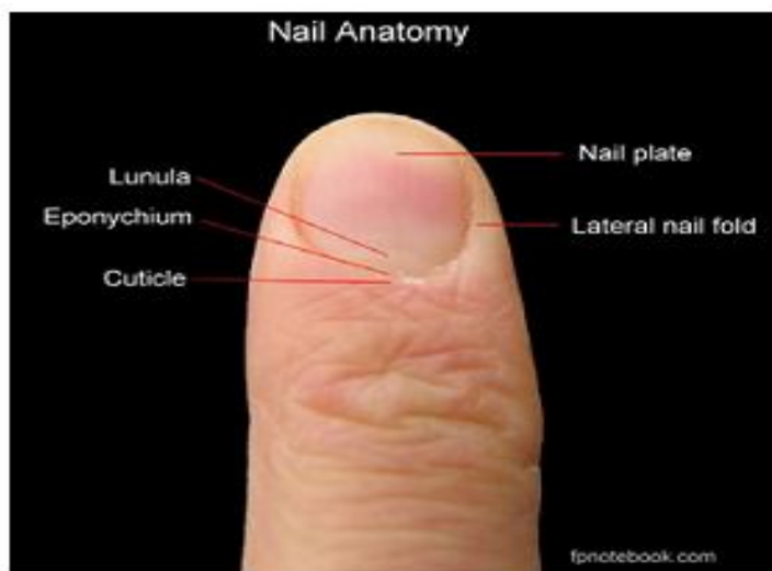
Figure 1: Anatomy of Nail [7]